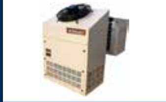
WONGSO PLUG & PLAY WALK IN CHILLER FREEZER (WEK)