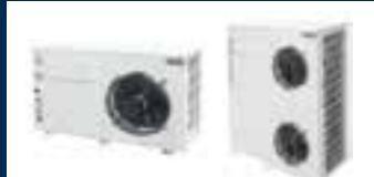
WONGSO COMMERCIAL CONDENSING UNIT (WCCU)