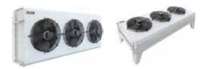
WONGSO AIR COOLED CONDENSER (WAC)