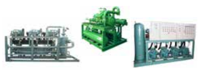
WONGSO RACK CONDENSING UNIT (WRCU)