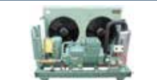
WONGSO AIR COOLED CONDENSING UNIT (WACU)