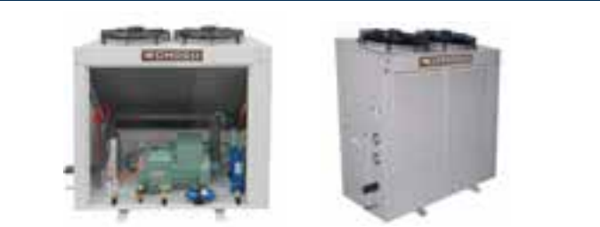
WONGSO MULTIPURPOSE CONDENSING UNIT (WMCU)