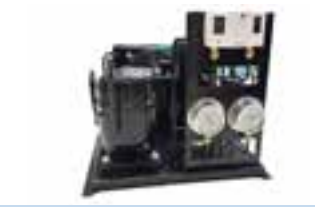
WONGSO LIGHT CONDENSING UNIT (WLCU)